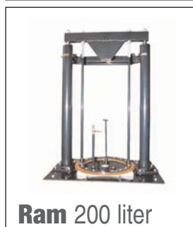
Ram 200 liter