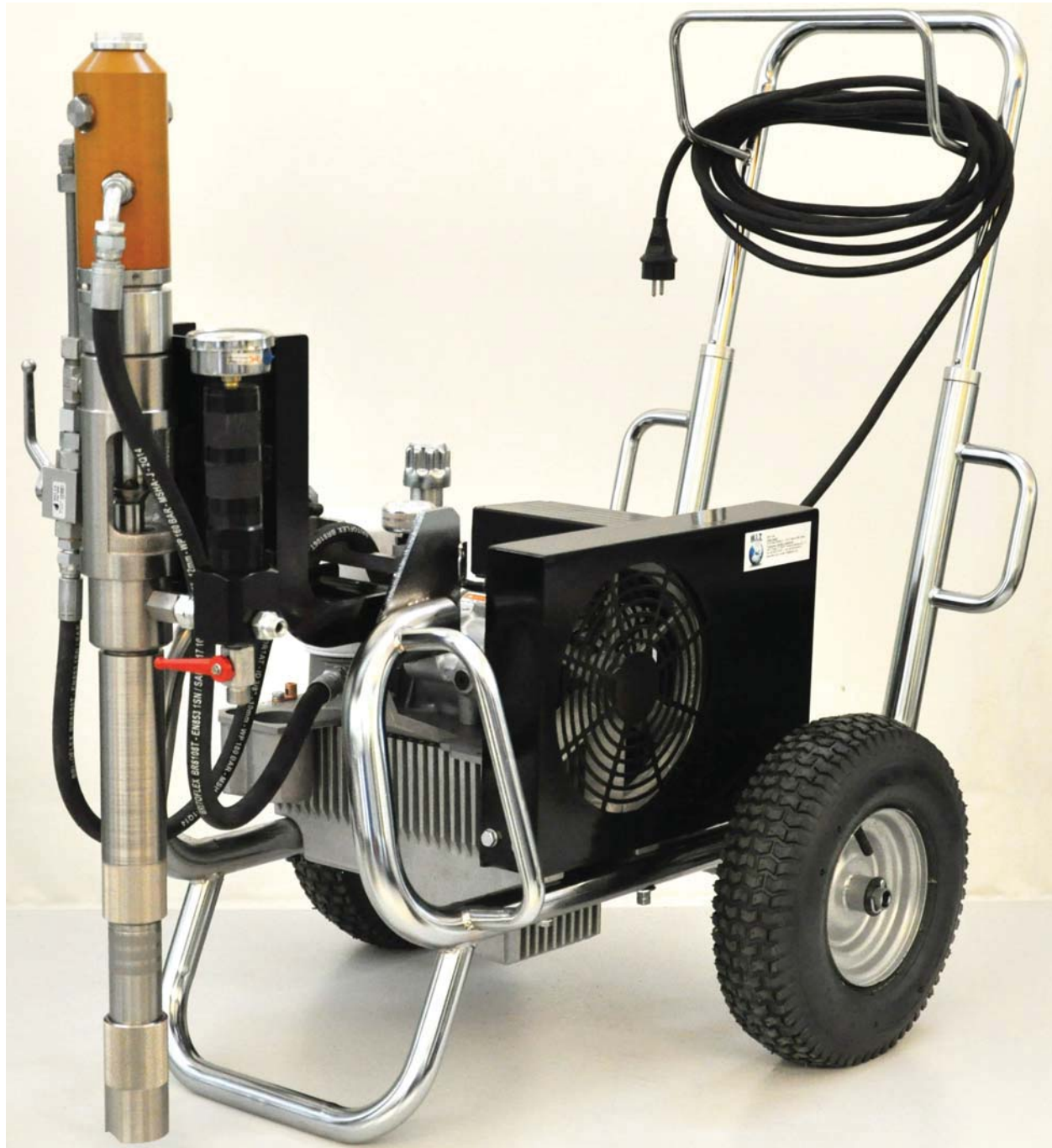
HYDRA Series Electric hydraulic airless piston pumps